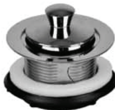
59-0015 Touch Toe