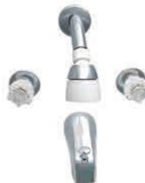
59-5010 Chrome 8"