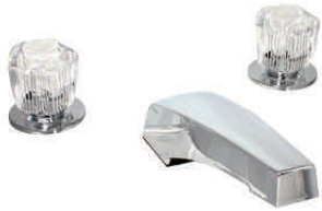
59-5016 Chrome Adjustable 8" Centers