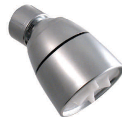
59-0055 1/2" Shower head, less arm and flange