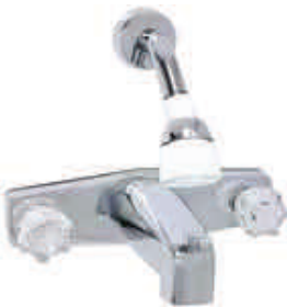
59-5025 Chrome 8"